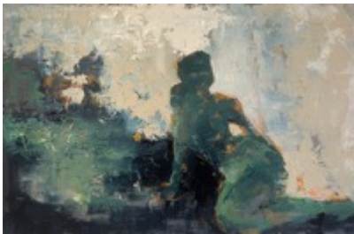
KL Folgner A Mind Like a Diamond

Acrylic on Bamboo Paper (framed) 18 x 21 in. $850