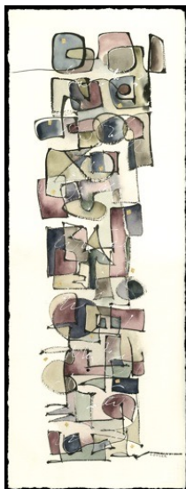
Sherrie Lovler This Journey to Ixtlan

Mixed mizuhiki paper, wall sculpture 36 x 100 x 2 in. $1500