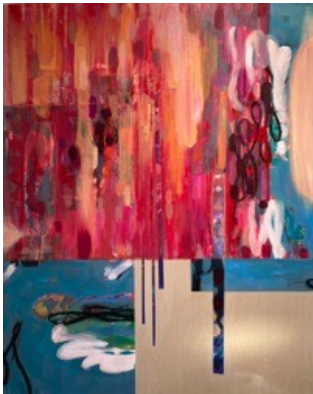
Sandra Wolfson Fire and Water (1 of 3)

Mixed Media on Wood Panel 30 x 24 in. $3000