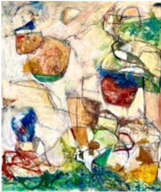
Diane Goldstein Santa Fe # 5

digital infrared, archival pigment print 12 x 18 in. $700