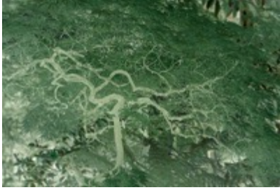
Ann Ginsburgh Hofkin California_21_0754

digital infrared, archival pigment print 12 x 18 in. $700