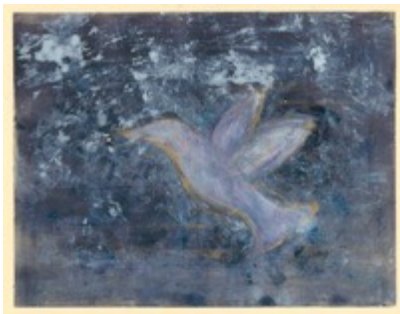
Ruth Gendler Peace Dove 1