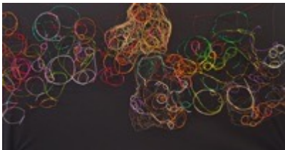
Naomi Kubota Lee Multiverses

Mixed mizuhiki paper, wall sculpture 36 x 100 x 2 in. $1500