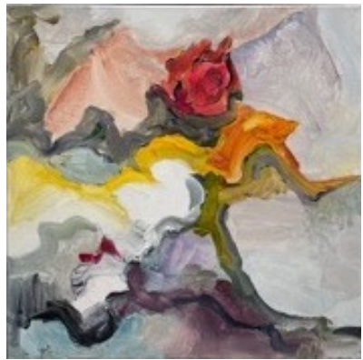
Shamy Noily Un-Still Life

Rattan, handmade paper, sumi-e, kakishibu 42 x 18 x 18 in. $1100