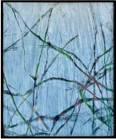
Mary Lee Cole Greenhouse Window