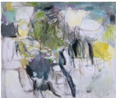
Helen S. Cohen Dawn Chorus 5

encaustic, oil and graphite on wood 30 x 24 in. $1200