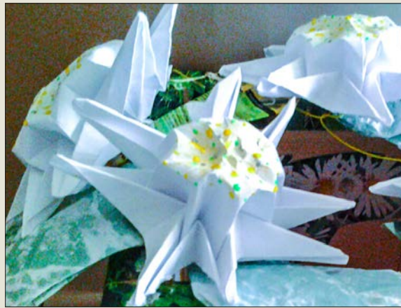
EMILY WONG, PAPER CRAFT