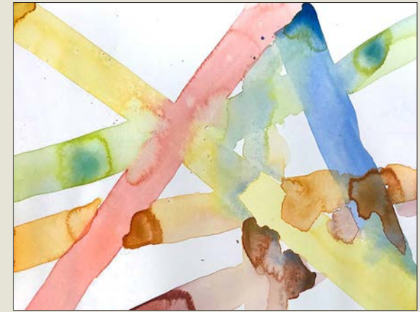
CANDICE, YOUTH DRAWING ATELIER