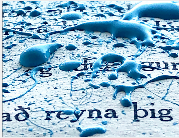
DAN CASSIDY, MACRO PHOTOGRAPHY