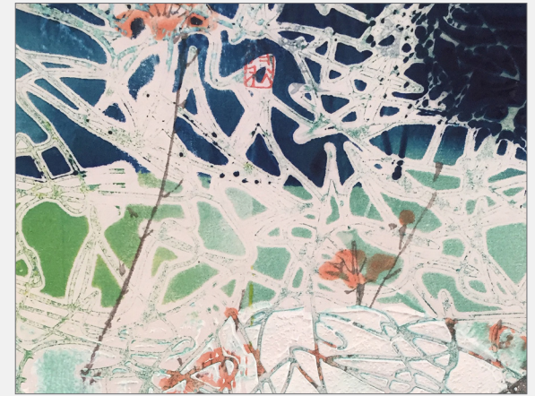
CANDIS COUSINS, MONOPRINTING